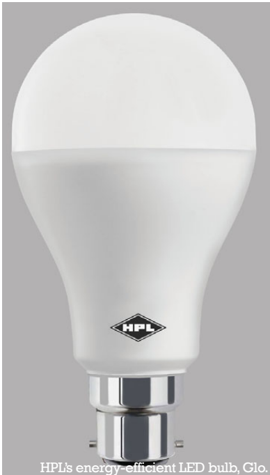
HPL's energy-efficient LED bulb, Glo.