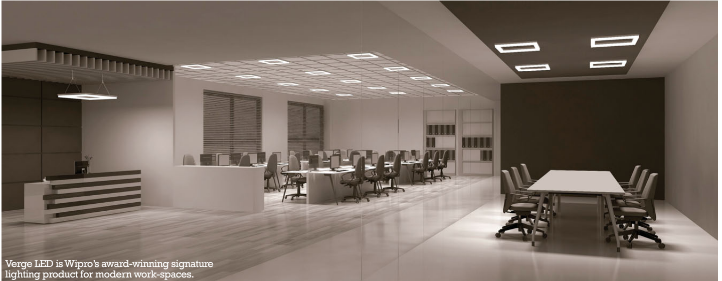
Verge LED is Wipro's award-winning signature lighting product for modern work-spaces.

to 'sense and feel' and be more 'intelligent', thereby, bringing down energy costs."