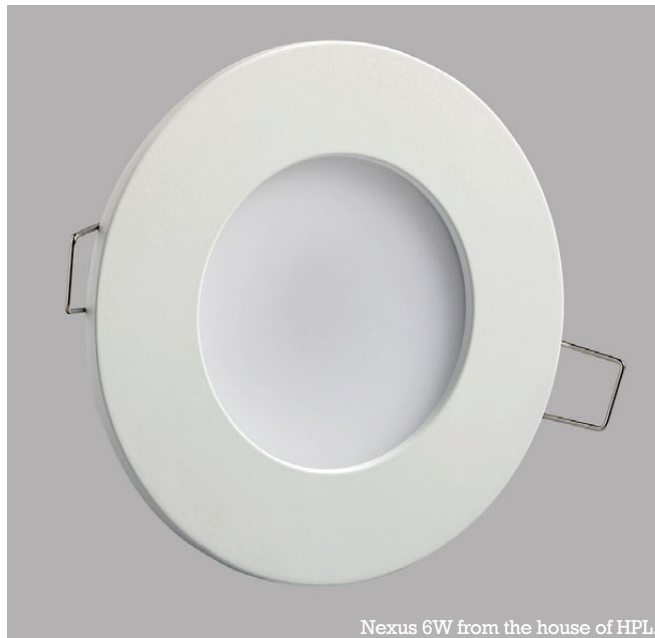
Nexus 6W from the house of HPL.