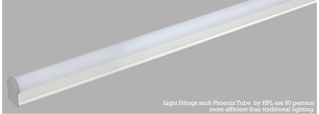
Light fittings such Phoenix Tube by HPL are 80 percent more efficient than traditional lighting.