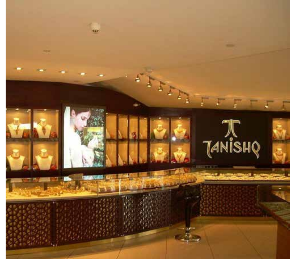
Lighting in a Jewellery Showroom

in retail lighting. The conventional light sources used to emit a lot of heat and UV rays that used to affect the colour and life of the products in the store. LEDs do not have these problems, and are also the most cost effective. Moreover, conventional light