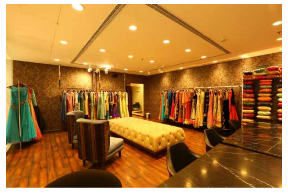
Lighting Done by Endo India