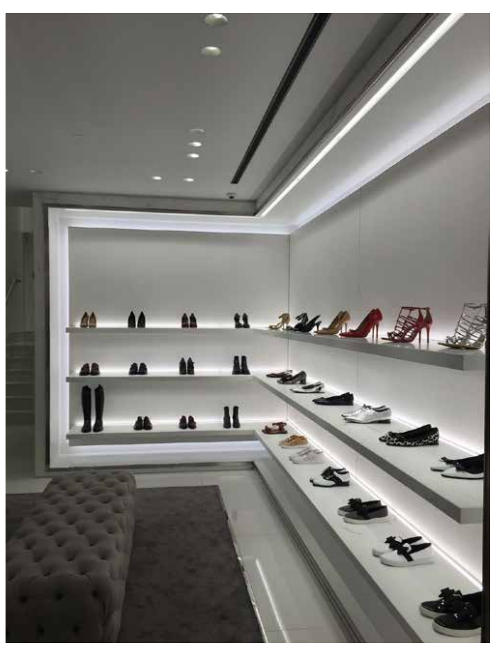
Lighting in a Footwear Showroom

statement from longer viewing distances, the product lighting is required when the products are being viewed closely."